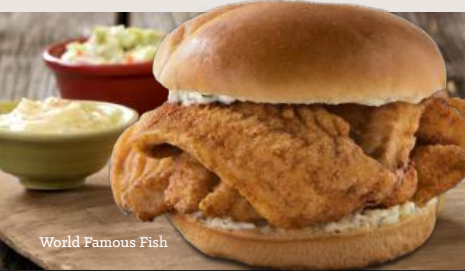
World Famous Fish

wild-caught, sustainable fried Alaskan fish fillet 490 cal 7.99 ADD OUR FAMOUS TARTAR SAUCE 260 cal